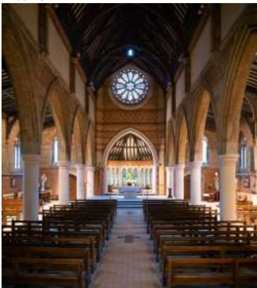
Looking West to High Altar