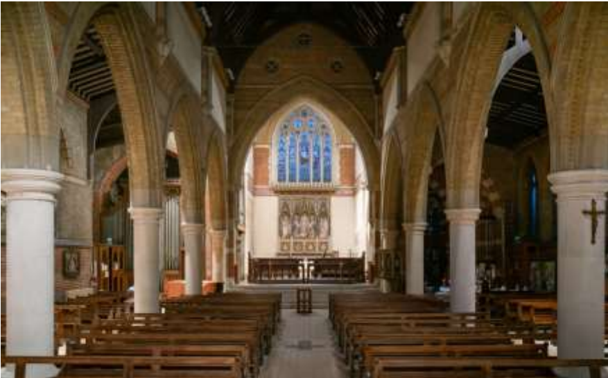
Looking East to Choir and old chancel