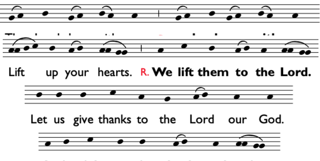
It is right to give thanks and praise.

The priest praises God for his acts, and then we join with the angels in their song of praise, as the choir sing (in English or Latin):